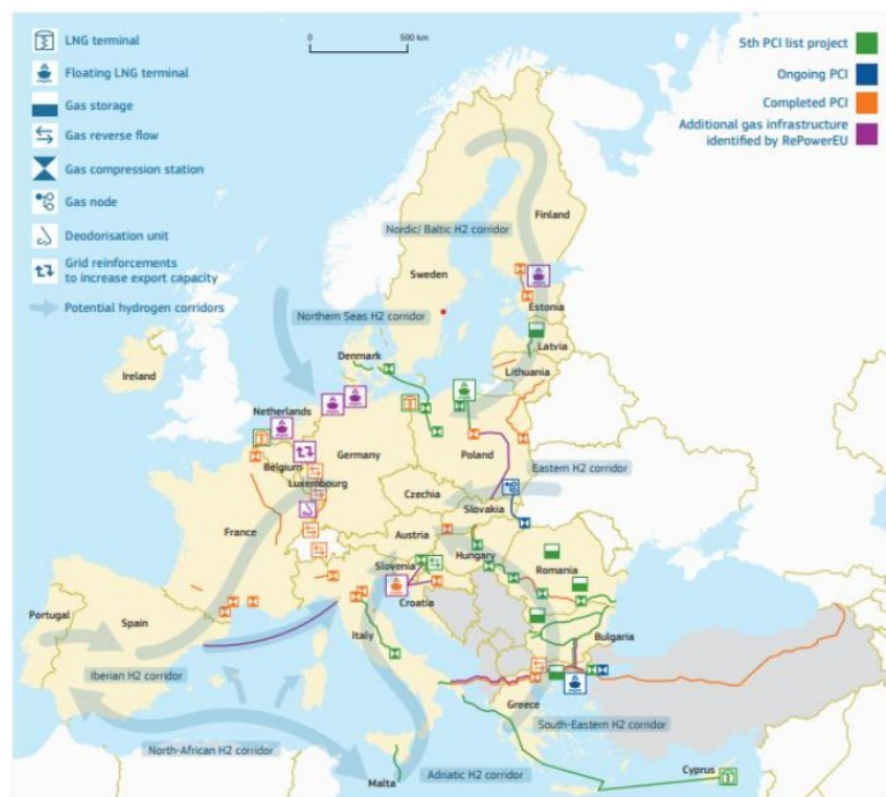
Map 1: Map of potential hydrogen corridors