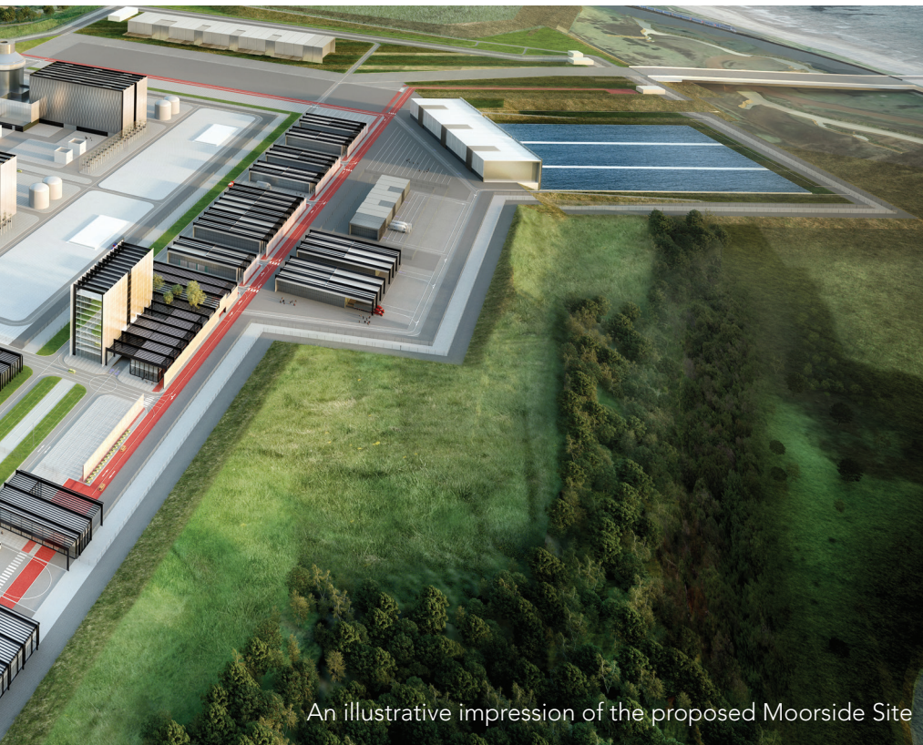
An illustrative impression of the proposed Moorside Site