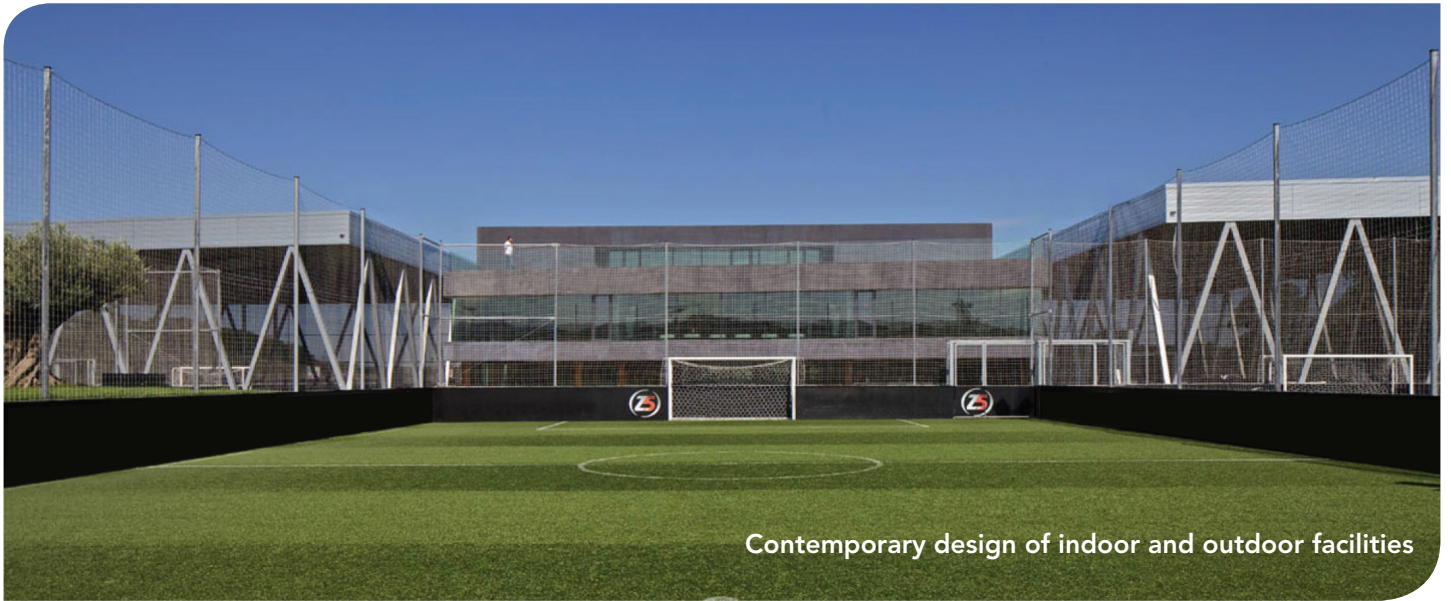
Contemporary design of indoor and outdoor facilities

and visual amenity; investment in landscape and townscape enhancements to improve the visual appearance of the areas and improve quality of life.