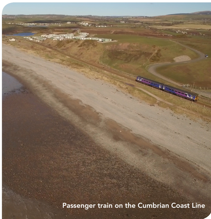
Passenger train on the Cumbrian Coast Line

There is the potential for NuGen to utilise the Port of Workington for Sea / Rail / Road logistics facilities, for storage, consolidation and sequencing of deliveries, and with the option for development of additional port side facilities, if required. This remains under consideration with NuGen in discussions with the Port of Workington.