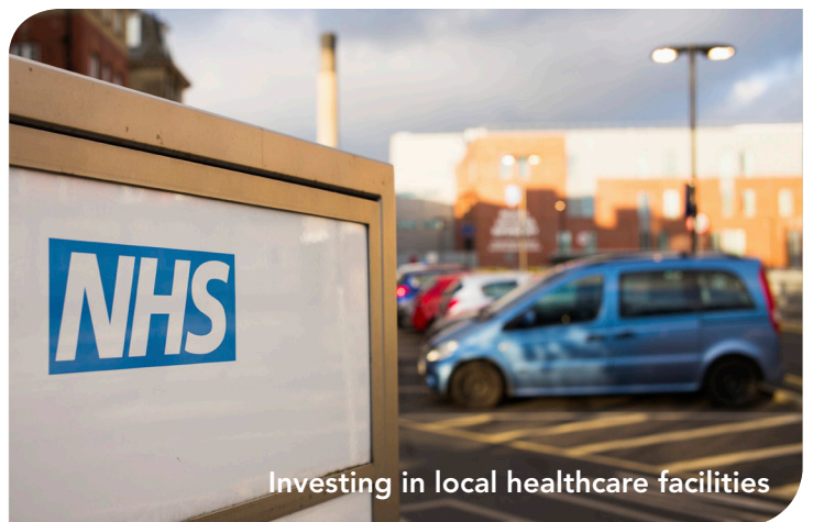
Investing in local healthcare facilities