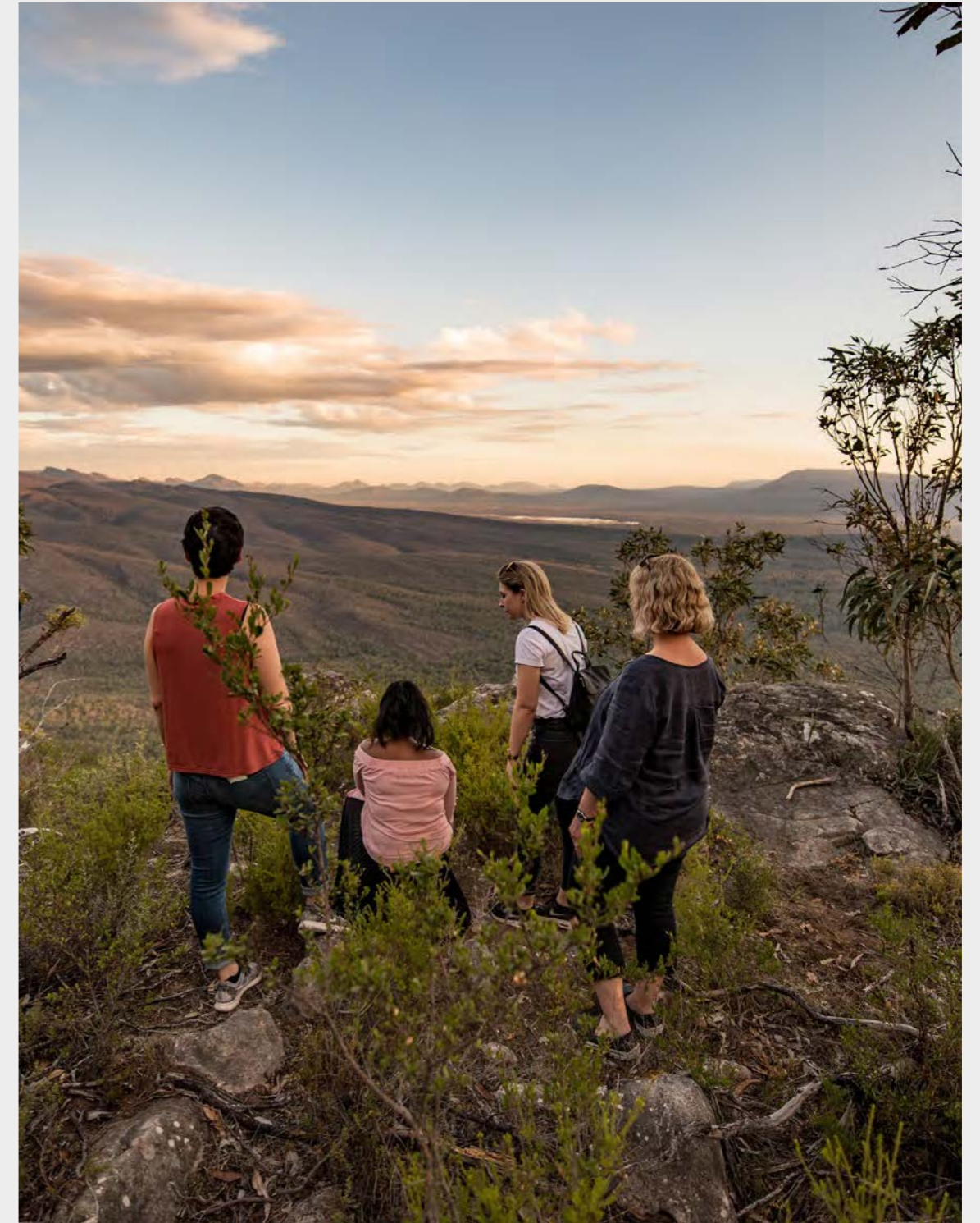
Australia, photography by Intrepid Travel

The dawn of a new era of travel beckons, one where a culture of extraction has no place. The resounding call to action – the ‘now-or-never’ rhetoric – must echo throughout the travel industry, guiding us away from a world marked by unsustainable values.