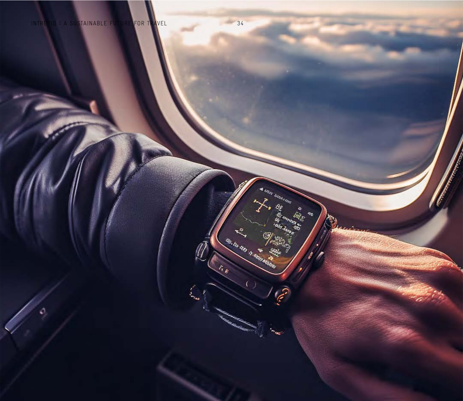
Real-time Footprints, AI imagery