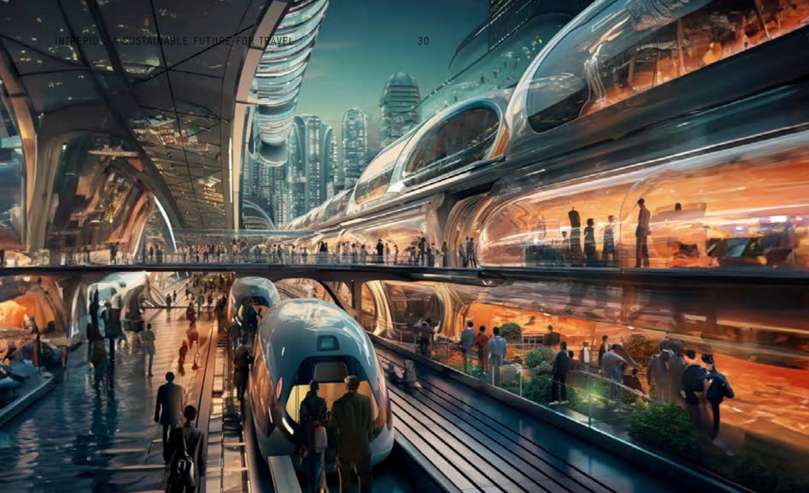
Enhanced Eco-mobility, AI imagery