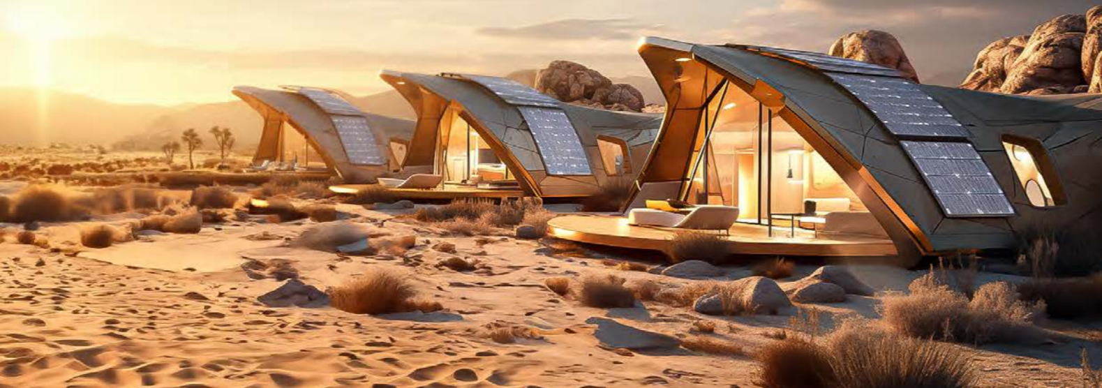
Ephemeral Escapes, AI imagery