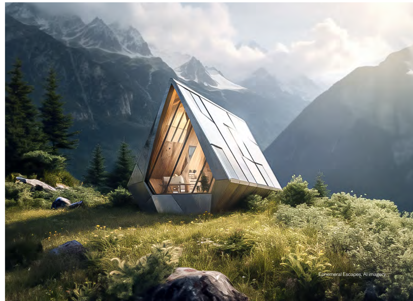
Ephemeral Escapes, AI imagery