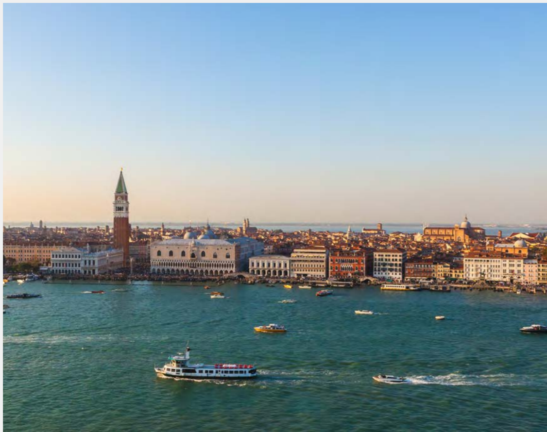
Venice